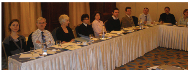
The SEDENTEXCT Annual Review meeting, held in Athens on 9th January 2009. The meeting included the European Commission's Scientific Officer responsible for SEDENTEXCT.